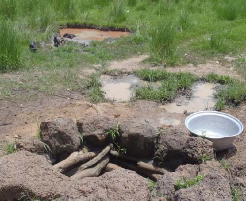
Previous water source.