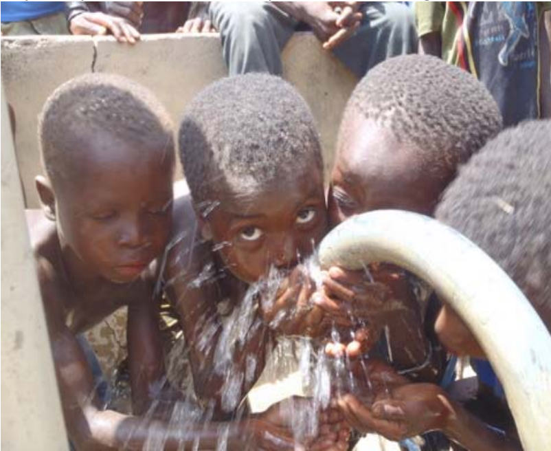
Community children pumping clean, safe drinking water from their new and reliable water source.