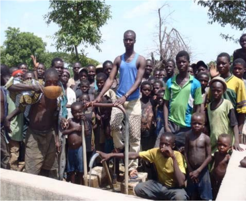
Community members pumping clean, safe drinking water provided by LWI Burkina Faso. This community will no longer be forced to share a water source with their livestock and have a sealed off water source to prevent the well from debris and other contaminants.