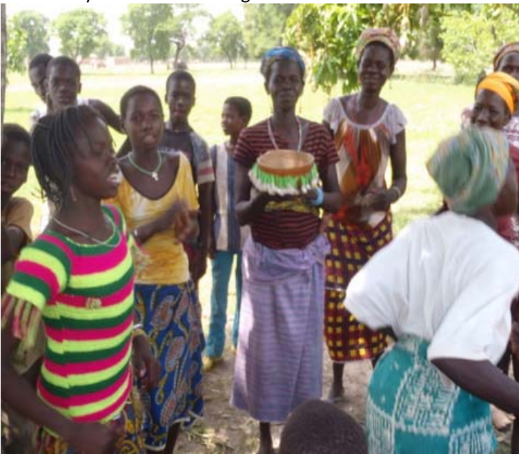
Community members made food for the drill team every day. These women expressed their immense gratitude for the team helping provide them with a clean, safe water source.