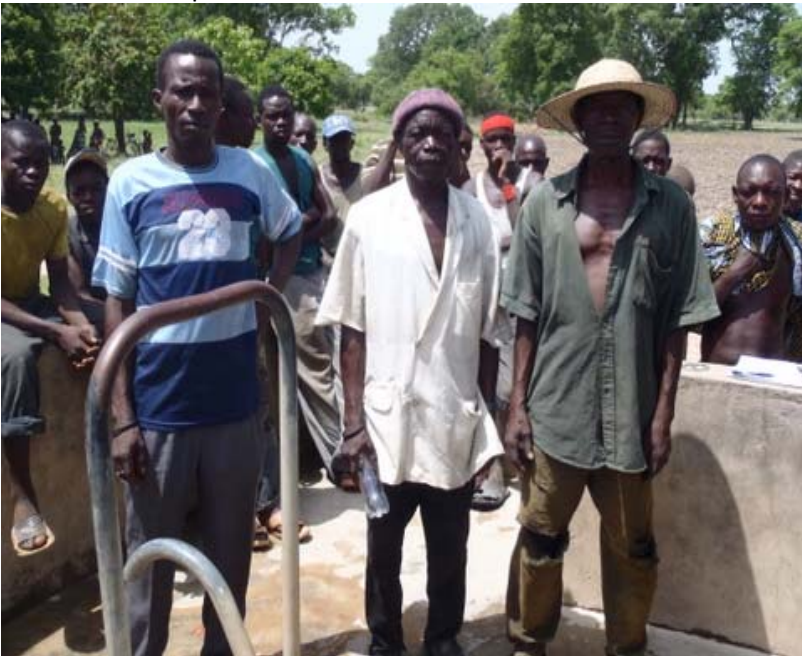
Water committee responsible for maintaining the well and who were provided with a LWI Burkina Faso contact number in case their well were to fall into disrepair, become subject to vandalism or theft.