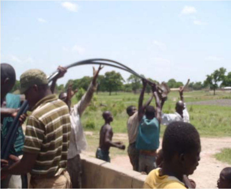
Project in process and community members assisting the LWI Burkina Faso team with the water project.