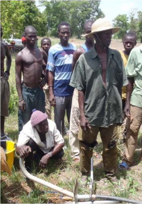
Community members assisting the LWI Burkina Faso team.