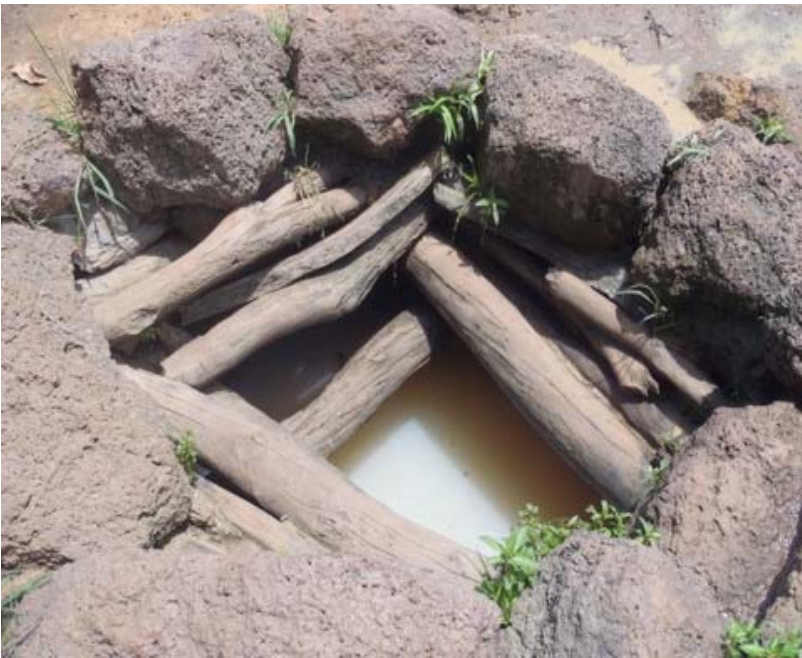
Previous water source used by community members and livestock, to meet all of their water needs.